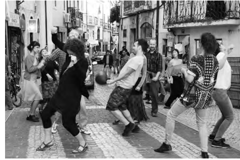
Fig. 11. Pedras Festival 2017, by the artistic collective Centre in Movement.