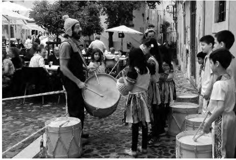
Fig. 10. Young band Batucaria organized by Renovate Mouraria association in 2017.