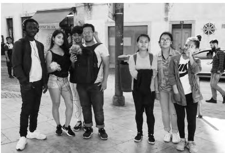
Fig. 18. Space recognition activity with teenagers, in itineraries in the neighbourhood, recording sounds of the environment.