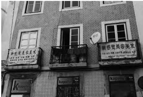
Fig. 4. Chinese services on the second floor of a building in Cavaleiros street.

of food commerce in the neighbourhood (35%), with minimarkets, grocery stores and Halal butchers 3 . The majority of the Indian, Nepalese and Bangladeshi population live in the former Socorro and Anjos parishes. The small properties, trade, and services of all these South Asian ethnic groups represent 14,8 % of the total working population, who are therefore considered highly entrepreneurial immigrants just behind the Chinese, representing 27% 4 .