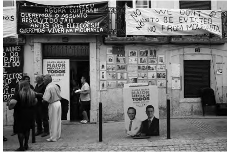
Fig. 6. Two real estate international investment projects at Intendente square.

the local commerce, the local taverns, and family restaurants, and the craftsmanship ateliers and shops, including the socio-cultural and regional associations, which cannot afford to pay the high rents of their establishments.