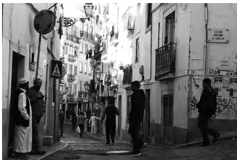
Fig. 2. Friday at Terreirinho street, close to Baitul Mukarram Mosque.

Mouraria's socio-cultural sustainability should be grounded on a balance between the economic and social development of the neighbourhood, the integration of cultural diversity and the continuity and respect for cultural identity legacies. The urban space must be prosperous, dynamic, allowing for the quality of life of all its residents. Without the social inclusion, communication, dialogue and active participation of all of them, it is not possible to achieve this sustainable evolution 1 . Under present conditions, Mouraria's landscape identity, understood as the construction of the sense of the self in space, cannot be durable due a short-term fluctuating population (migrants and tourists), and the economic gentrification processes. The danger lies in the transformation of a cohesive historical local community into a fluctuating one in a constant state of displacement and isolation (Fig. 3).