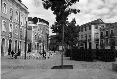
Fig. 8. Mouraria's Action Programme and the urban rehabilitation of Intendente square in 2013.