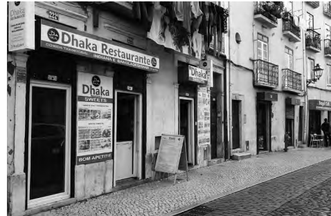
Fig. 5. Bangladeshi restaurants on Benfornoso street.

In the last years, Lisbon has seen a huge increase in city tourism, with 2,9 million visitors in 2012 5 . Therefore, touristic lodgings play an important role in the offer of services, with an increase in the number of short term rental offers in virtual platforms such as Airbnb and HomeAway . In a characterisation survey carried out in June 2016, only within these platforms, we accounted an offer of 528 touristic apartments and 119 renting rooms 6 . In July 2019, a new analysis of data extracted from www.airdna.co , reporting the short-term rental properties in Mouraria within the same virtual platforms, gave us the value of 1.223 apartments and 196 renting rooms; an offer which represents a growth of 119%, in three years. There is also an international real estate investment market in the renovation of housing for specifically touristic lodging or for investment purposes. Foreigners are encouraged to apply for the so-called golden visas and fiscal benefits when pursuing new properties. At present, every single corner in the neighbourhood has buildings under renovation or under construction (Fig. 6). The local residents are forced to accept that their lively social and collaborative neighbourhood is changing by the forced eviction of their neighbours, and the non-renovation or the increase of their rents. Gentrification processes also affect