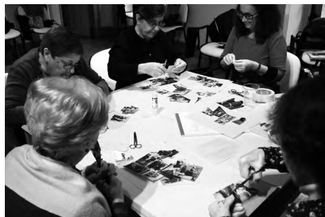
Fig. 16. Talking around a table about historic photographs. Senior participants chose images related to their life stories in Mouraria.