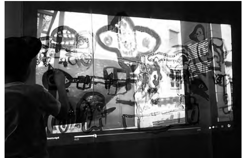
Fig. 13. Representing a scenography using three layers of information: visual, resonant and tactile.

With itineraries in the neighbourhood, the participants selected elements from the neighbourhood in order to transform them into story characters and parts of the scenography. We also explored their inner subjective world to discover how their personal emotions were translated into character's personalities, behaviours and interactions (Fig. 12). The scenography was composed by three layers of reality: sounds, textures, and visual elements (Fig. 13). The characters took shape in cardboard cut-out figures. The objective was the performative choreography of the children's bodies in space while playing freely a storytelling narrative using a shadow play (Fig. 14). In this performative storytelling game, the kids interacted with each other discovering relations between characters, affinities, and emotional relationships with the urban environment. In a final stage, where the participants had to communicate a somatic landscape, we asked them to design costumes and masks and to perform a story with their own bodies, interpreting their imaginary characters (Fig. 15).