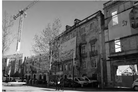
Fig. 7. Local neighbours claiming their rights for rental lodging in Lagares street number 25.

In 2018, sixteen residents in Lagares Street won the battle against an investor that bought the house for touristic lodging (Fig. 7). With the aid of the City Council the residents arrived at an agreement with the new owner to extend for five years their new rent contracts, delaying their possible eviction. At the present, this process of social desertification of the historical centre, causes, for the first time, the anonymity and isolation of the few local residents that remain in the neighbourhood. In the past, Mouraria was known for the social cooperation among its neighbours. Nowadays, residents turn out to be all strangers to each other.