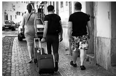
Fig. 3. Tourists on Benfornoso street. The heart of Mouraria's multicultural commerce and services.