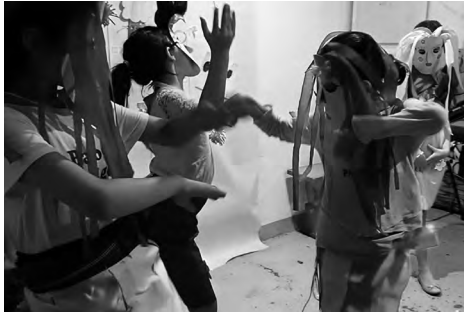
Fig. 14. Performative choreography of the children's bodies in space while narrating a story using a shadow play.