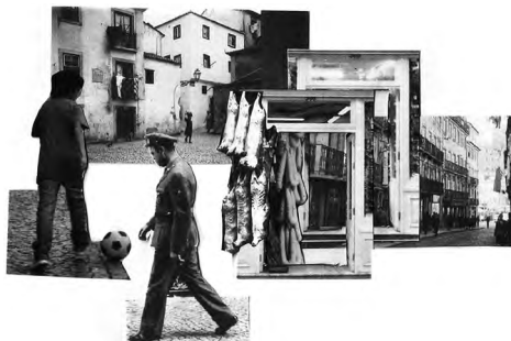
Fig. 17. Example of a senior's story collage, which expresses the memory of a body performance in the public space of the neighbourhood.