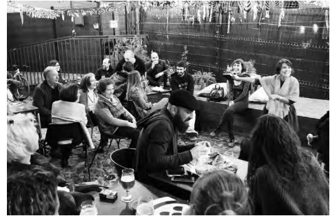
Fig. 9. Social cultural gathering at Renovate Mouraria association in 2017.