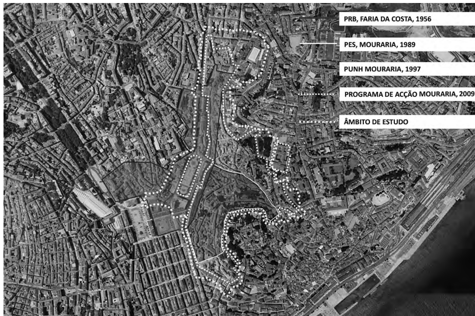
Fig. 1. Limits of Mouraria neighbourhood in Lisbon according to the four different urban requalification plans (1956, 1989, 1997, and 2009). In white the area of our present case study.

In these laboratories, we aimed to observe those emotional processes related to the mental construction of the urban landscape, such as the sense of belonging, the redefinition of the affects, and the review of the memories of the place, as dynamic processes of constant qualitative evaluation and personal and collective reformulation of the urban space. Our objective was to give shape to those meaningful, perceived and experienced urban spaces through an artistic language. All the different modes of artistic expression were centred on the body, where subjective and collective identities were articulated. We consider that sensorial experiences, memories and emotions configure a universe of spaces of representation, which enrich the intangible heritage of the neighbourhood and enlarge the cultural images and historical symbols attached to the values of its urban landscape.