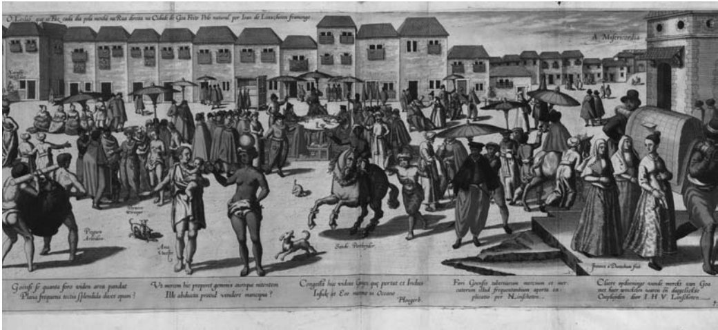
Illustration 1 – View of the market in Goa, in Linschoten, Jan Huyghen van, Itinerario, voyage ofte schipvaert naer Oost ofte Portugaels Indien 1579-1592, c. 1596

In 15 th century Europe, the idea of the existence of ancient and powerful civilizations in India was broadly accepted, but accurate and reliable information about them was scarce. This situation changed radically in the wake of Vasco da Gama's travels. The first half of the 16 th century compelled Portugal to confront itself with this region and was the beginning of a lasting process or trivialization of mutual contacts between Europeans and Indians as with other communities from a myriad geographical and cultural provenance, but living in or related to India. Indeed, the Goa, as the whole of Hindustan Coast, had a cosmopolitan character by excellence – used to a long contact with Turks, Malays, Chinese, Africans (for instance, a long lasting trade existed between Eastern African and Eastern Indian maritime cities of present Gujarat, and Chinese communities established in India were especially active both in trade and in manufacture) 1 .