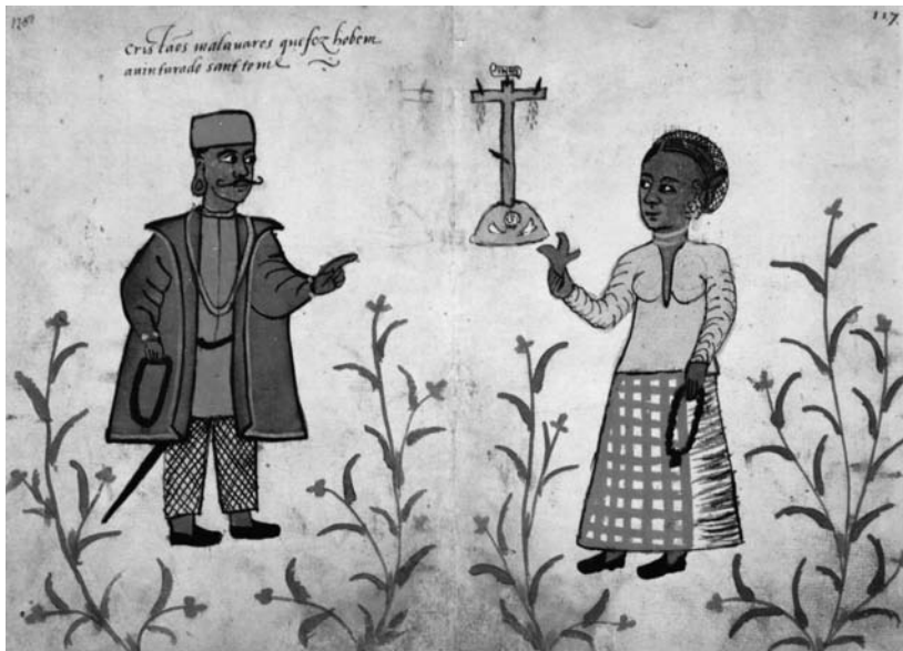
Illustration 3 – St. Thomas Christian couple, in Codex Casanatense, end of the 16 th Century, Biblioteca Casanatense nr. 1889, Rome, Italy

There are such a quantity of them [The Mappila] and so closely related to the land that I have the impression that they form a fifth part of the population. These Moors called Mappila are present in all sea ports, cities and provinces. They are very rich and wealthy. The whole sea trade and navigation lies in their hands 48 .