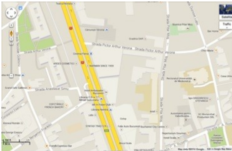
Map 1— Central area of Bucharest.

The framework of the project encompasses the central area of Bucharest: Magheru-Arthur Verona, Pitar Mos, Nicolae Golescu.