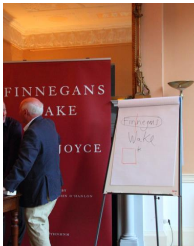
James Joyce Centre, 2010