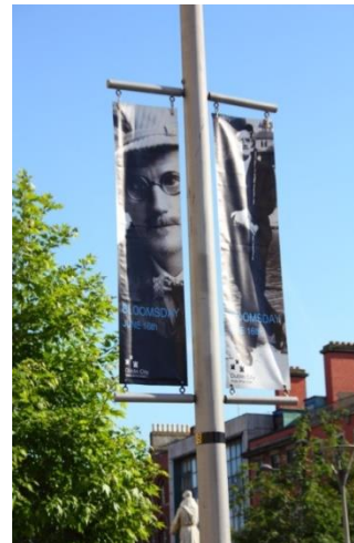
O'Connell Street, 2010

Besides the many events that take place every year, at the James Joyce Centre, during the entire week around June 16, evidence of Bloomsday celebrations can be found everywhere in Dublin.