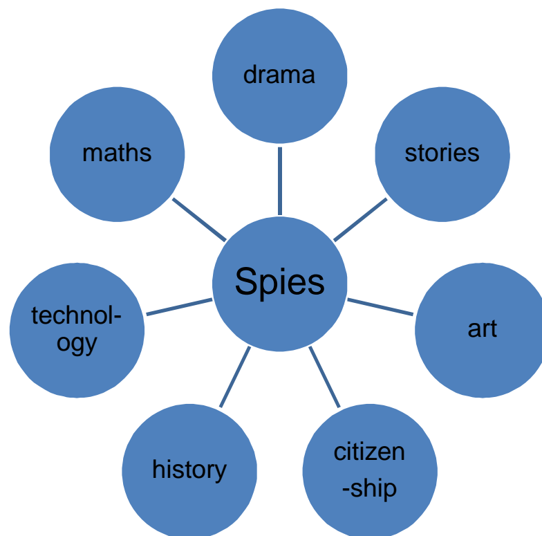
Table 2. A topic web for the theme Spies at beginner level

A theme-based approach can be used to plan and organise English language learning. Beginning with a theme which is developed through school subject areas to create tasks and activities and from which language learning outcomes are selected (Moon; Cameron). The following diagram shows a topic-web for the theme of Spies, a theme on our beginner level course for 10-12 year old learners at BC Lisbon.