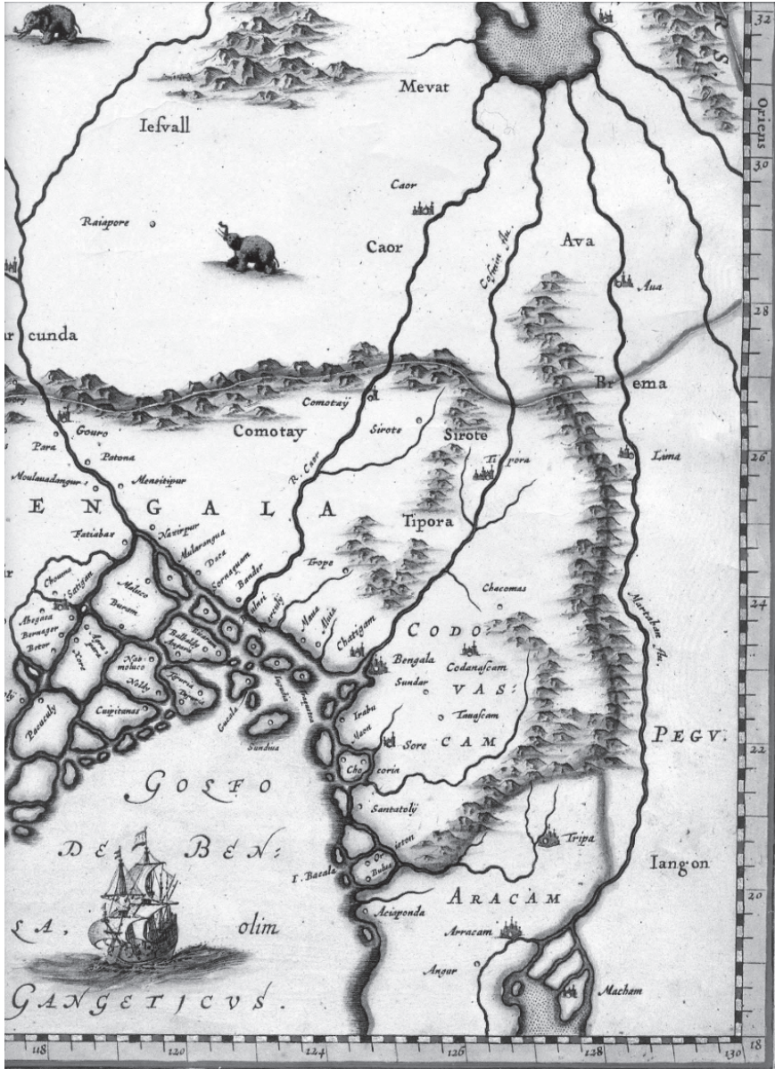
'Sundiva' in Johann and Cornelius Blaeu, 1638 AD, 'Magni Mogolis Imperium' Size 52 x 41.5 cm.